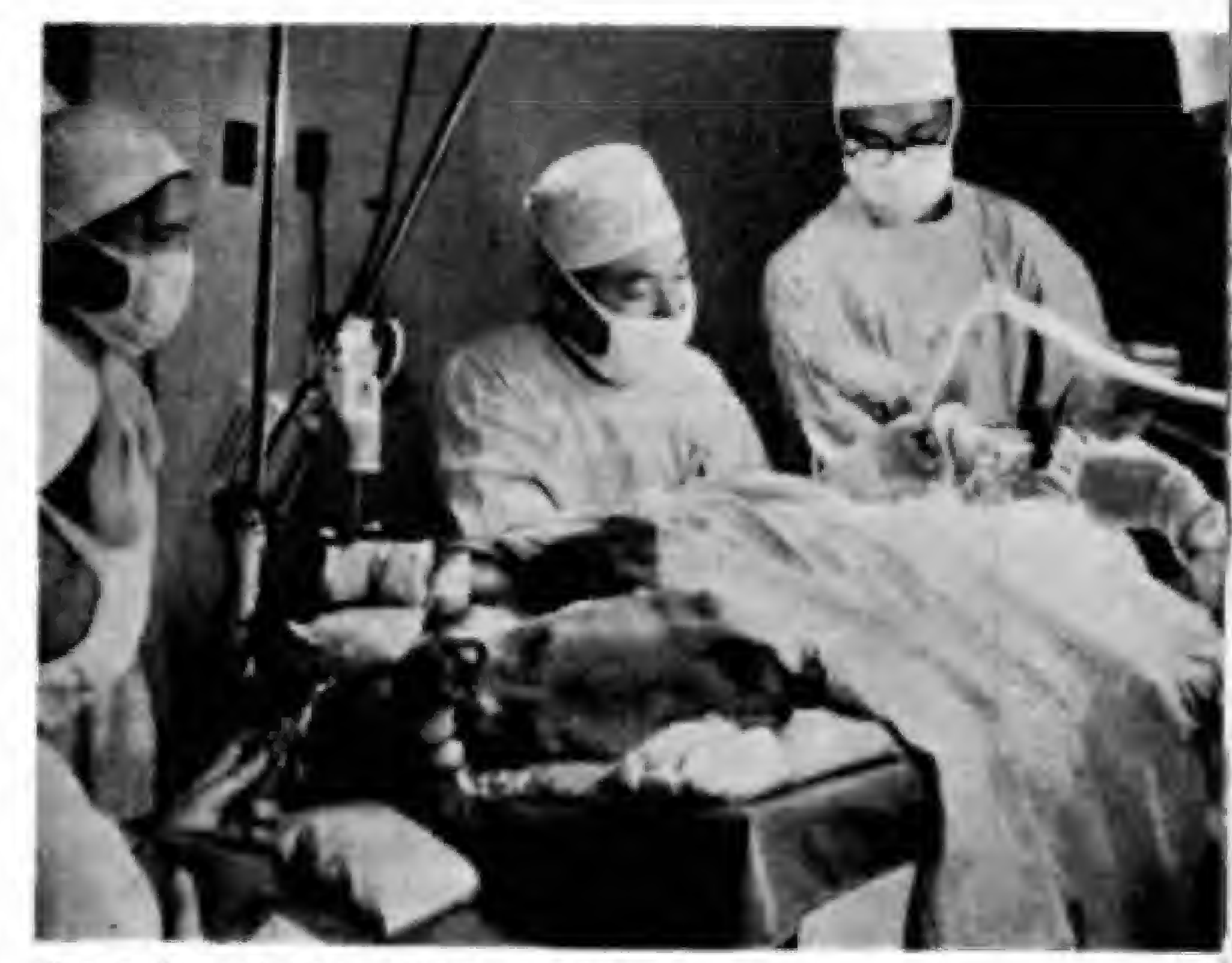
The author rejoins a dog's leg which has been kept at low temperature.